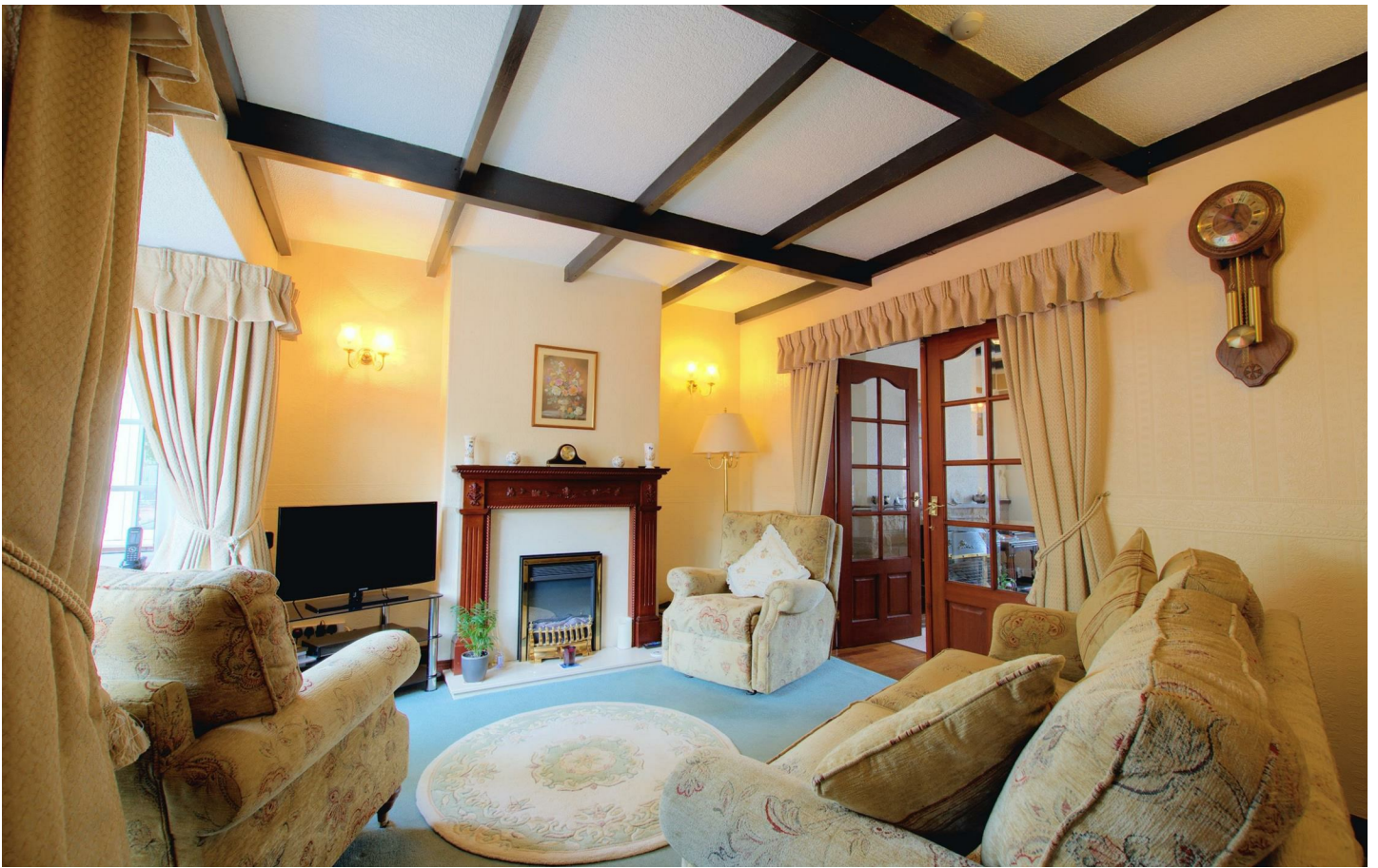
A WELL PROPORTIONED THREE BEDROOM SEMI DETACHED HOUSE WITH A GARAGE.

Situated in this popular and convenient residential location which is well placed and readily accessible for a variety of local shops and amenities including schools, transport links, Chilwell Retail Park and Attenborough Nature Reserve, this fantastic property is considered an ideal opportunity for a range of potential purchasers including first time buyers, young professionals and families.